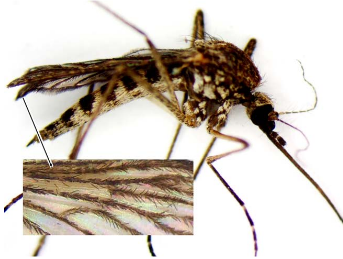
Female Aedes washinoi . Wing scales are shown to differentiate from Aedes squamiger , which has rounded wing scales.