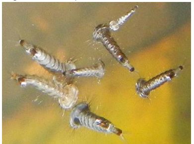
Figure 1: Mosquito larvae

Mosquito larvae (see Figure 1) look much different than the adult mosquitoes that bite. They live in water. They are often called "wigglers" because of the way they wiggle if you cast a shadow upon them or try to catch them. Let us know if you find mosquito larvae growing indoors.