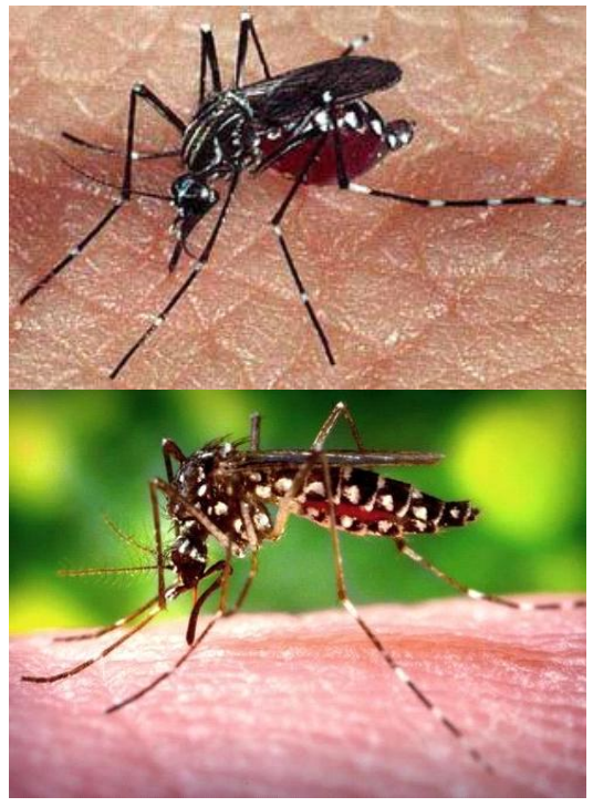
YELLOW FEVER MOSQUITO (Aedes aegypti)