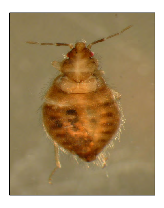
Swallow bug, Oeciacus vicarius

Swallow bugs are the hairy cousin of the bed bug, Cimex lectularius . Swallow bugs infest mud nests built by cliff swallows on the outside of buildings. Occasionally these bugs will make their way indoors and bite and feed on the blood of the occupants. However, humans are a poor host and swallow bugs need their avian hosts for their continued survival. Cliff swallows are a protected species and their nests can't be disturbed during nesting season (from about Feb. 15 – Sep. 1) without a permit from the U.S. Fish and Wildlife Service. The swallow bug pictured above was collected by a local pest control operator from a local residence.