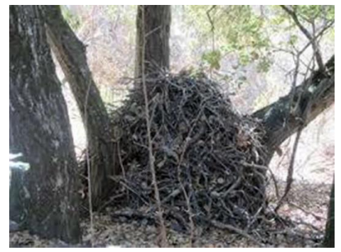
Dusky-footed Woodrat Den