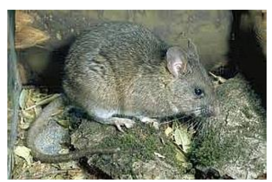
Dusky-footed Woodrat - Neotoma fuscipes

Aedes aegypti mosquitoes are present in 22 California counties. One person has tested positive for Zika virus in California in 2021 to date; the infection is travel-associated. There have also been 10 cases of dengue fever and three cases of chikungunya, all travel-associated.