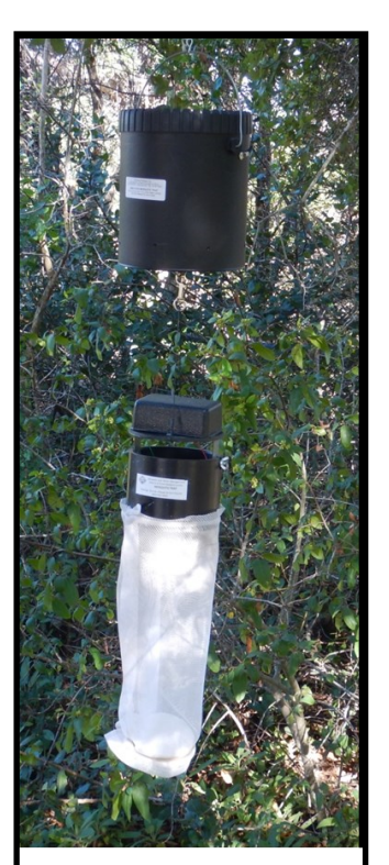
CO<sub>2</sub> traps lure many species of mosquitoes with dry ice, mimicking the smell of an exhaling animal. These traps are set overnight.

Gravid traps are mainly used to collect Culex mosquitoes as they lay eggs on the water surface; they are then tested for West Nile virus. Filter paper may be attached to the side in case invasive Aedes mosquitoes ready to lay eggs are nearby.