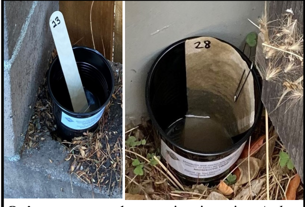
Ovi-cups are used to monitor invasive Aedes mosquito activity in an area by providing an ideal egg-laying habitat

In areas where invasive Aedes mosquitoes are suspected to occur, BG-Sentinel traps, along with the traps pictured here, will be used to detect them. Most traps are set for about a week.