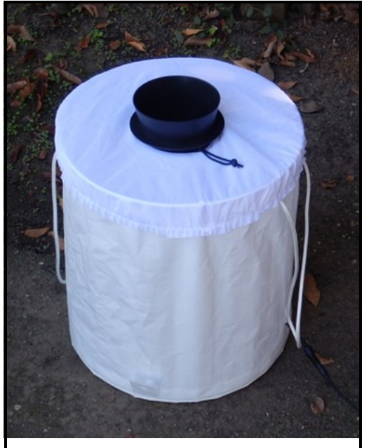
BG-Sentinel 1 Mosquito Trap

BG-Sentinel mosquito traps are placed in urbanized settings rather than near the wetland habitats that most of our native mosquito species prefer. BG-Sentinel traps utilize an electrical outlet or can run off an automotive battery and are baited with substances found on human skin.