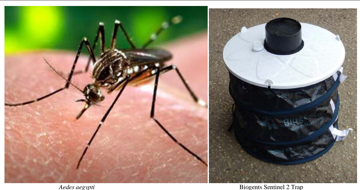
Yellow Fever Mosquito Aedes aegypti

The yellow fever mosquito, Aedes aegypti , is native to Africa but has been invading much of the world, including California. They preferentially feed on humans; they aggressively bite during the day. Ae. Aegypti lay eggs in containers associated with people such as potted plant saucers, bird baths, rain gutters, tires, and buckets. The eggs can remain viable on the surface for many months and hatch when the container fills with water. Larvae develop in as little as seven days and in containers as small as a bottlecap. This species is capable of carrying and transmitting Zika virus, dengue virus, yellow fever virus, chikungunya virus, and Mayaro virus to people. They typically stay within 150 meters (492 feet) of their development site. The Biogents Sentinel (BGS) trap has been developed specifically for detection of the yellow fever mosquito and the Asian tiger mosquito ( Aedes albopictus ). It uses a human-scented lure, and mosquitoes are sucked into the collection net by a small fan. The fan can be plugged into an electrical outlet or attached to a 12-volt battery. The District has 12 BGS-2 traps and 3 first generation BGS traps.